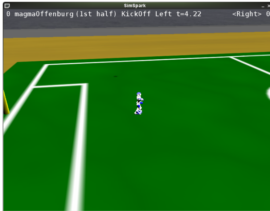
Figure 3.5: Press 'k' to start the game. The play mode will switch to 'KickOff Left' and the time will advance.

The next step is to start the soccer game. To do this please change back to the monitor window and press 'k'. The simulation time now start running and the game state changes to BeforeKickOff, please compare to figure 3.5.