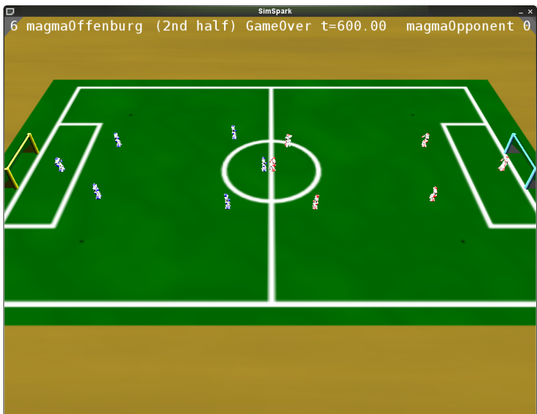
Figure 7.1: A screen shot of the soccer simulation with 6 vs 6 robots