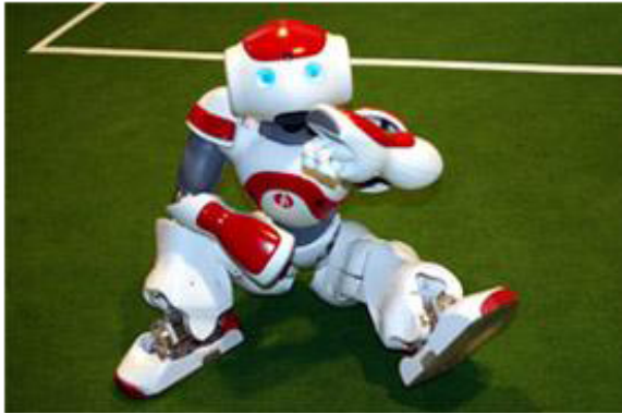
(a) real robot

The Nao humanoid robot manufactured by Aldebaran Robotics. This is the robot currently used in the competitions of the 3D Soccer Simulation League at RoboCup. Its height is about 57cm and its weight is around 4.5kg . Its biped architecture with 22 degrees of freedom allows Nao to have great mobility. The rcssserver3D can simulate the Nao robot nicely, see Figure 8.5.