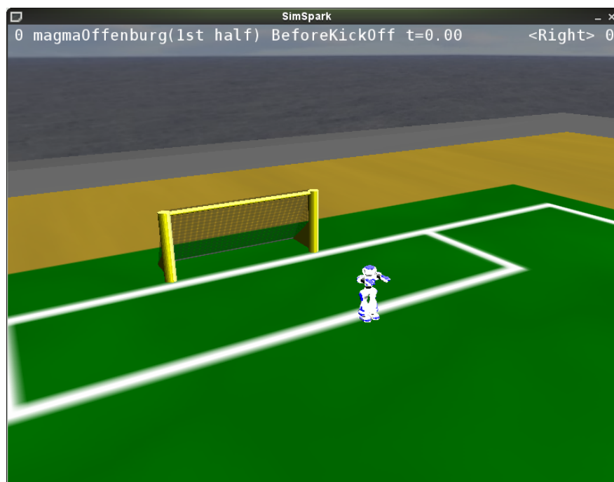
Figure 3.4: Moving around on the field using the arrow keys, PgUp, PgDown, and the mouse (with left mouse button pressed).