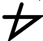
1: ends in half circle 2: projects out half a width